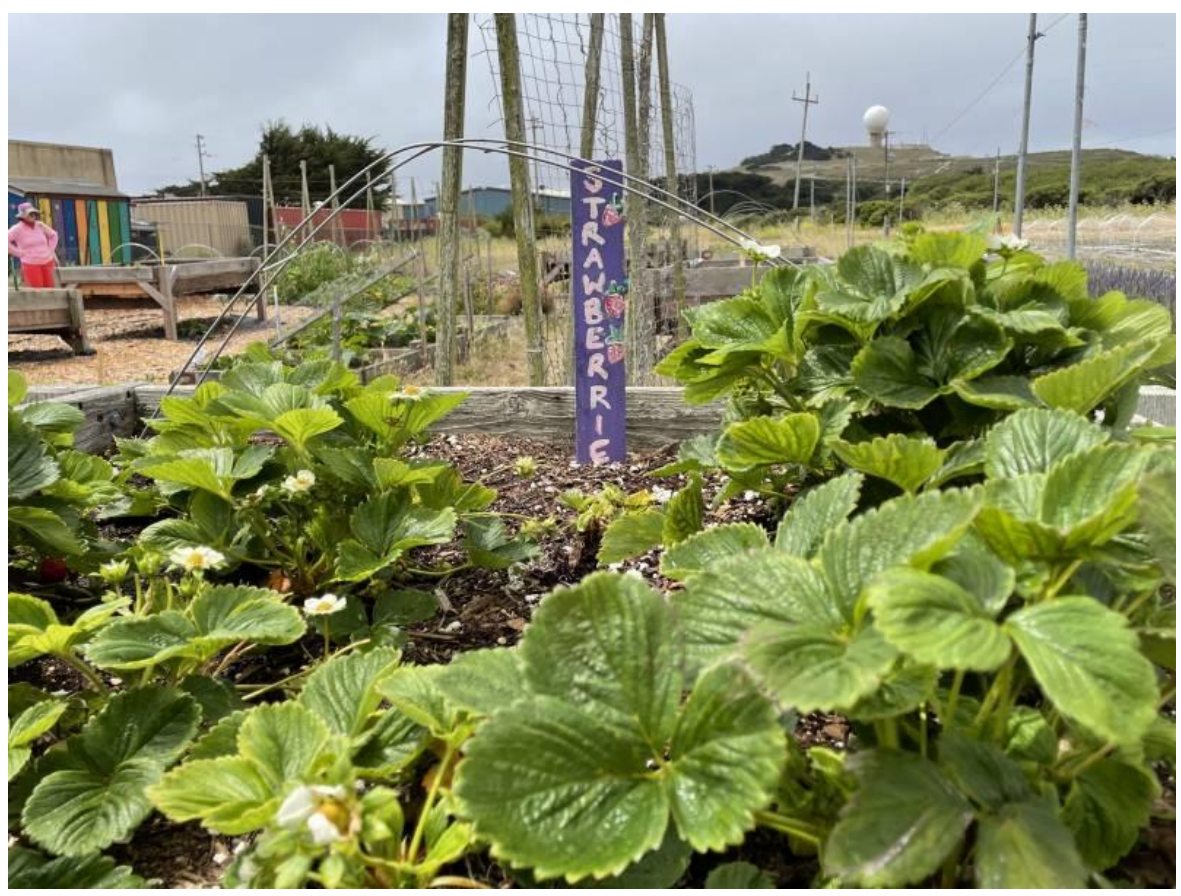
Big Wave sells produce like strawberries, peas, lettuce, squash and lavender.

Over the years, the parents' ambition for the place grew. Today, it includes plans for apartments, a community café staffed by residents, and office space to rent out for income. The idea is to provide a place where their adult children and other residents who join will soon be able to live independently, in a community of their peers.