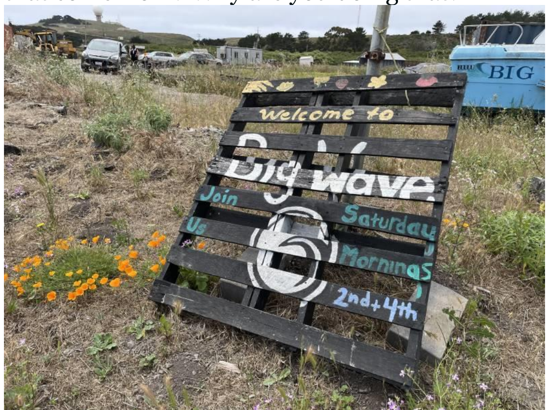
Big Wave has been a place for members to gather for two decades. The farm portion of the land sells eggs, lavender, vegetables and cut flowers.